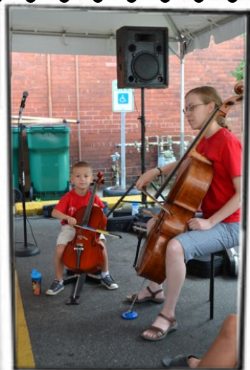
ELMWOOD AVENUE FESTIVAL OF THE ARTS